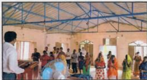
Singarajpally Roof Completed