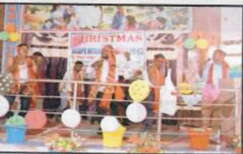
Pastor sing - song Drama