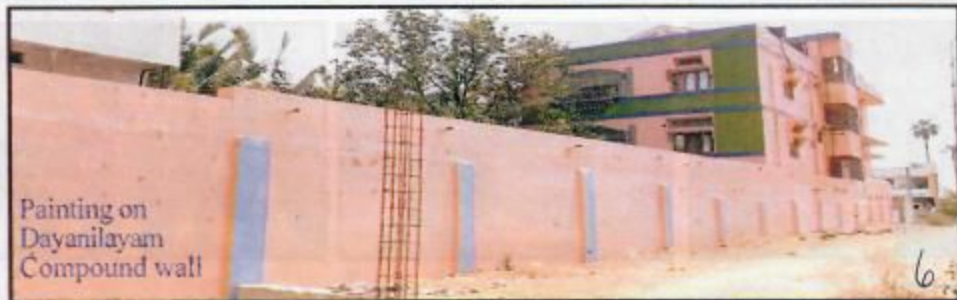
Painting on Dayanilayam Compound wall