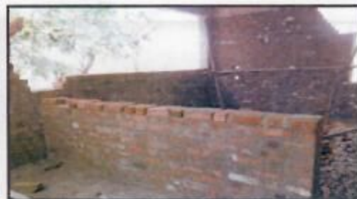
Nawabpet New Life Centre still under construction