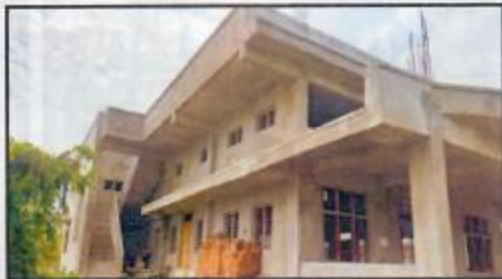
Kanchanpally New Life Centre