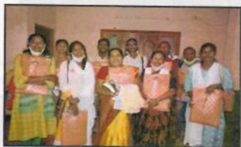
AIM Club Leaders received Christmas Gifts