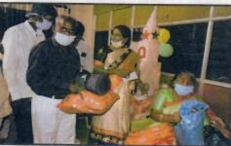
Christmas Gifts to Pastors (AIM)

A grand Christmas dinner was arranged and Christmas Gifts (winter blankets) were given to all of them. Pastors performed Christmas sing-song drama.