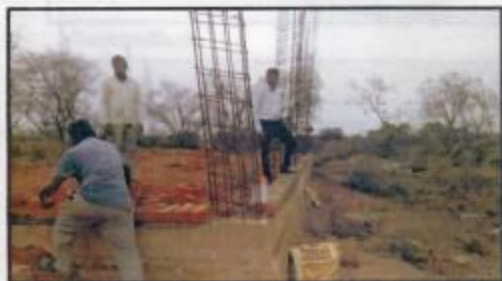
Vishwanathapuram New Life Centre