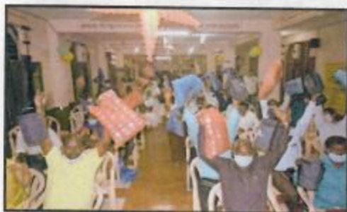
AIM Pastors received Christmas Gifts